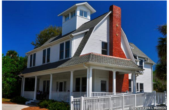
The Eldora State House is the last remaining home from a resort community that flourished on the shore of Mosquito Lagoon between 1900 and the late 1930s. The home was restored and opened to the public in 1999.