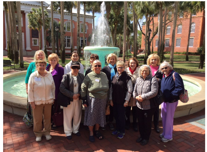
Touring Stetson University in Deland on a chilly March 8.