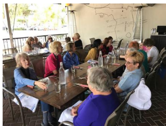
Lunch at Nova