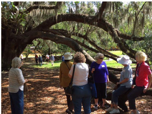
Even stalwart walkers need a rest, and what better place than on the branches of a centuries-old oak.

On April 13, the walking group toured the Lake Formosa neighborhood.