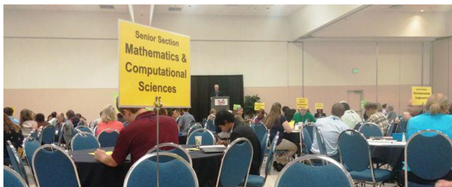
The nearly 400 judges get their instructions.