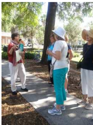
The Walking Group in Mt. Dora