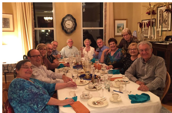
Dining Couples is baaaack!