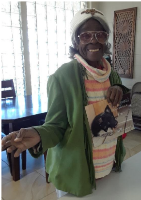
Resident with new calendar

Thank you all for contributing calendars yet again. To date, I have amassed 250 new 2019 calendars of all shapes, sizes, and focuses thanks to your generosity. In years passed, I have described the recipients of these calendars who are very grateful for a free useful item. Many recipients have to think twice about whether to buy those extra few groceries or to use that money to pay their electric bill, so to have a new free calendar to remind