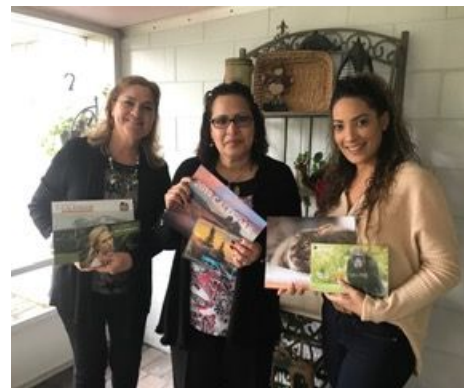
WPHA staff picking up calendars