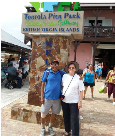
The Deos in Tortola

Hoops had to be removed before taking your seat in a carriage, and then they were hooked onto the back of the carriage.