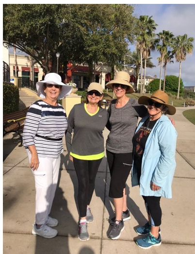
Sole Sisters meet for their weekly walk around Lake Baldwin. Come join them—starting now at 8:30 a.m. every Thursday.