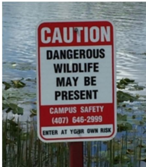
This could be serious.

On April 11, Exploring Central Florida headed for the wilds of . . . Rollins College?