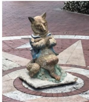
The "real" fox