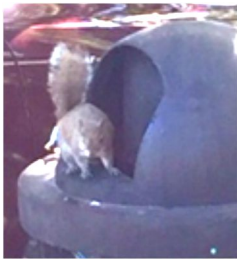
A squirrel attacks a garbage can