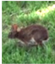
Man-eating bunny on the loose!