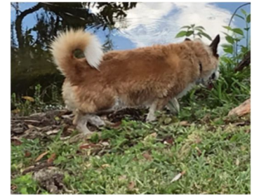
Run! It's a fox!

And speaking of a fox, April 11 had been picked in the wee hours of the morning to be FOX DAY . The sudden appearance of the fox on campus signifies an impromptu holiday. No classes, no teachers, no students. Buses pull up and the excited students are driven off to a day at the beach or a return to dreamland—their choice.