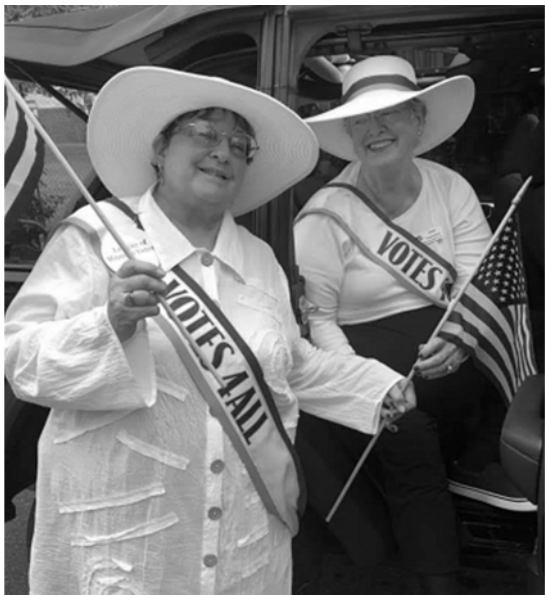
See their bios on the next page.