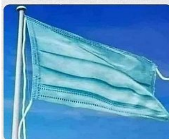
The Official flag of 2020

"We must criticize without wounding and debate without dehumanizing our opponents. Fight for the things that you care about, but do it in a way that will lead others to join you." Ruth Bader Ginsburg.