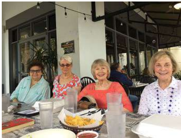
In May, 2021, members of Booklovers II celebrated the end of another year of educational and entertaining book discussions.