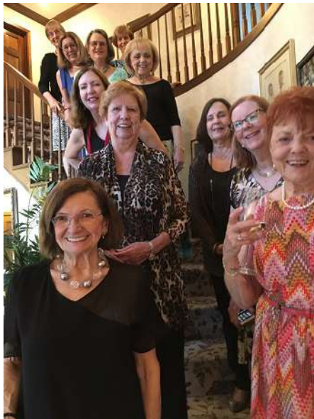
Booklovers VI finally got to enjoy the dinner they bid on at the Literary Luncheon in 2019. Thank you Dining-In!