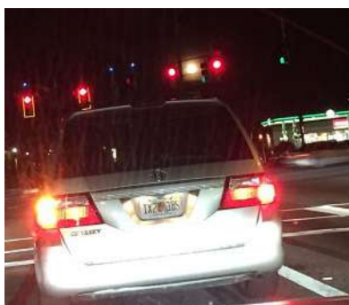
One night this past summer at the end of May, there was a special Super Flower Blood Moon. Driving home that night, Linda F. grabbed her cell phone to catch a picture of the moon just as it moved between 2 red traffic lights.