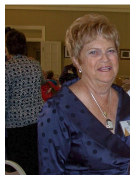
March 12, 2011 Literary Lunch Speaker: Pat Schroeder