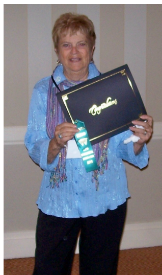
FL State Convention—Orlando, April 1-3 2011