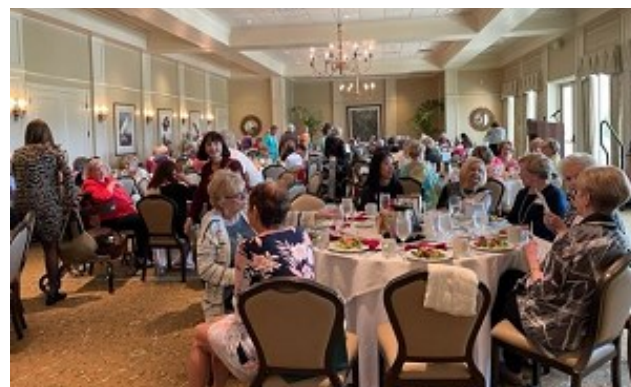
It was a full house (150) at Interlachen Country Club