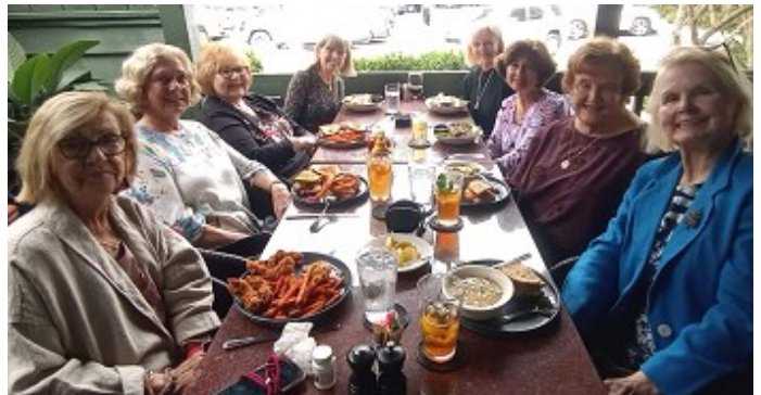
Book Lovers X Holiday Lunch Dec 14, at Dubsdread