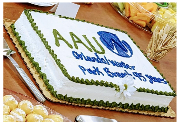
Happy 95th Birthday to our Branch. Now let's look forward to the Centennial.