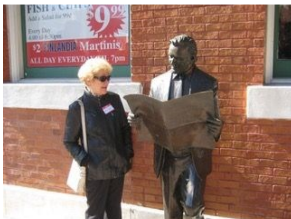
Touring Ybor City—Ellen strikes up a conversation with one of the local residents.