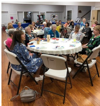
More pictures from September Welcome Event