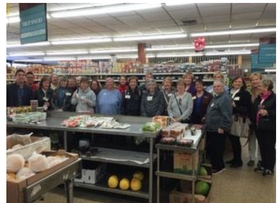
Touring the West End Market