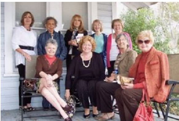
Booklovers at the Kerouac House in Winter Park