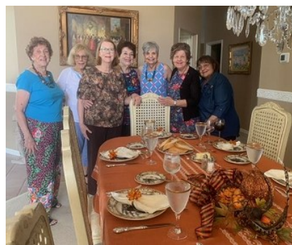
The Dining In Group