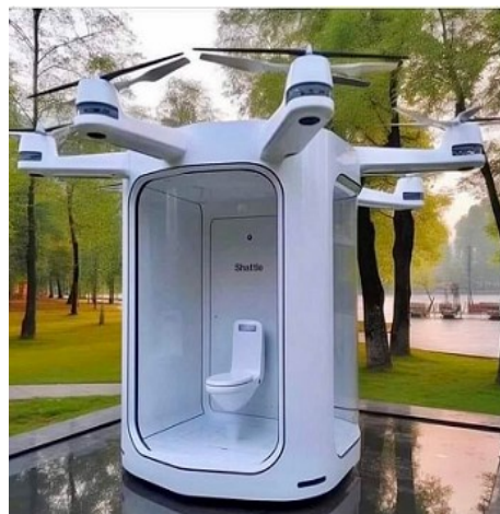
Just when you thought the future couldn't get any crazier, someone came up with a drone-carrying toilet. Sure, there's no towels, toilet paper or sink, but after all, Drone wasn't built in a day.