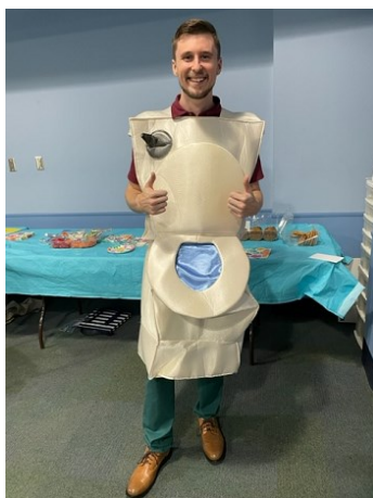
If this guy looks like he's wearing a toilet, you're not wrong. He was the mascot at the "If Your Pipes Could Talk" event on May 6. The program was arranged through an AAUW-FL Funded Project Grant.