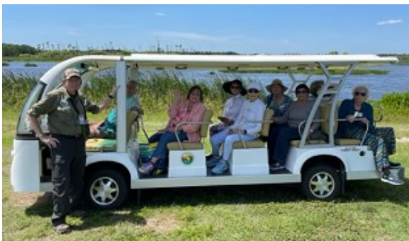
On May 2, ECF climbed aboard two "trams" which took us on a tour of the Orlando Wetlands in Christmas. This was ECF's second visit to the wetlands. If you've never been there, it's well worth it.