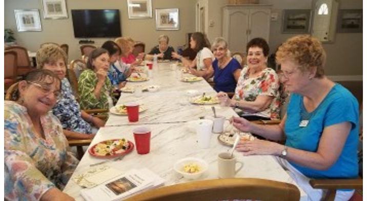
Cooking Globally has had lively and delicious gatherings all summer. See Cooking Globally on page 10 if you would like to get involved with this delectable group.