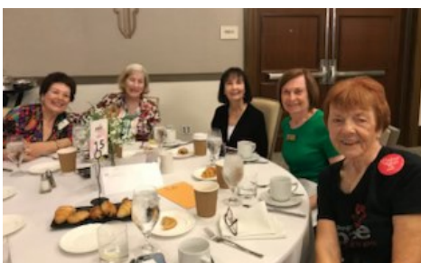
L to R